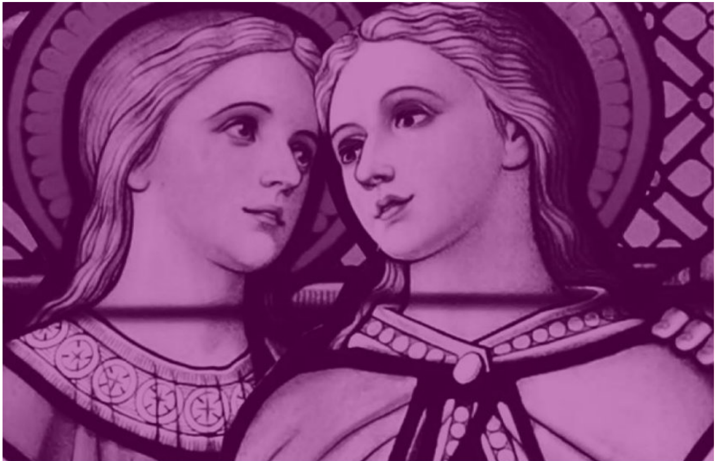
The church's logo

Opinion: It's known as the Pussy Church and it's harmful