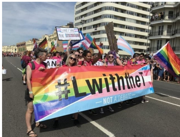
The group led the parade one month after the Pride in London ‘hijack’

“We immediately got in touch with Brighton Pride highlighting the importance of supporting the transgender community at this time and they agreed for the #LwiththeT campaign to lead the parade.”