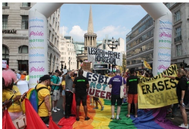
Anti-trans protesters took over the front of Pride in London